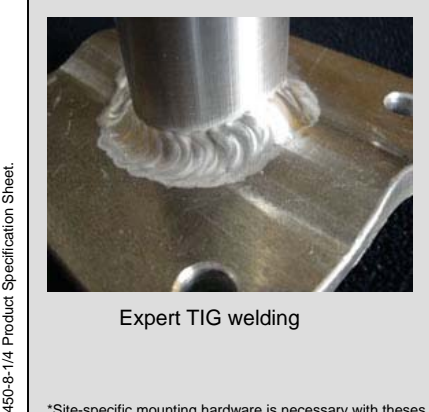
Expert TIG welding