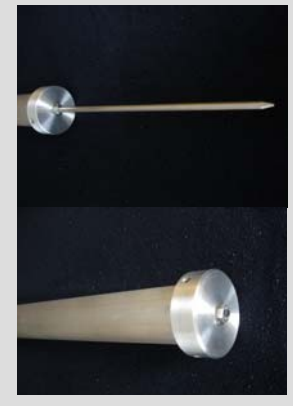
Optional lightning rod

JAG to determine suitable clamps for your application