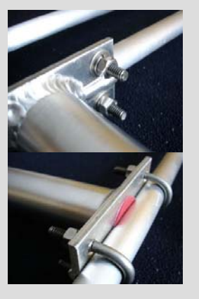
Heavy-duty dipole fixture